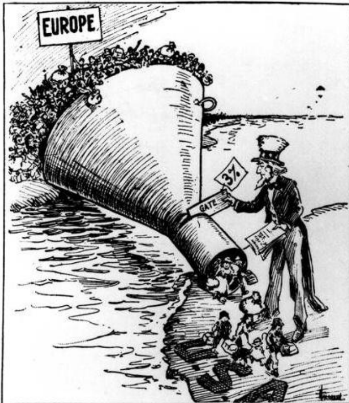
The Only Way to Handle It